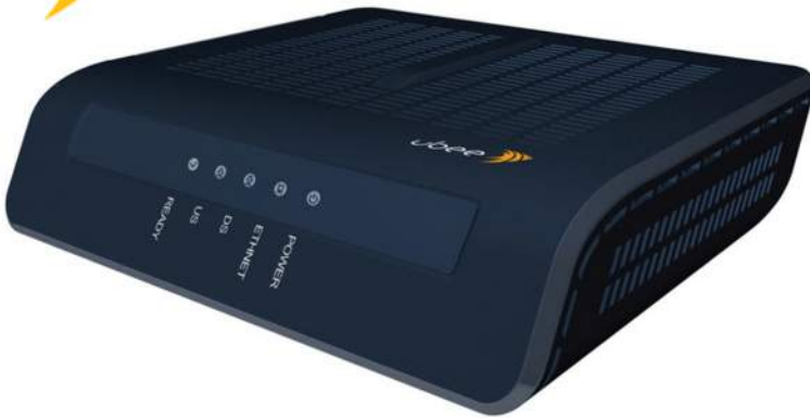
Device Front Panel